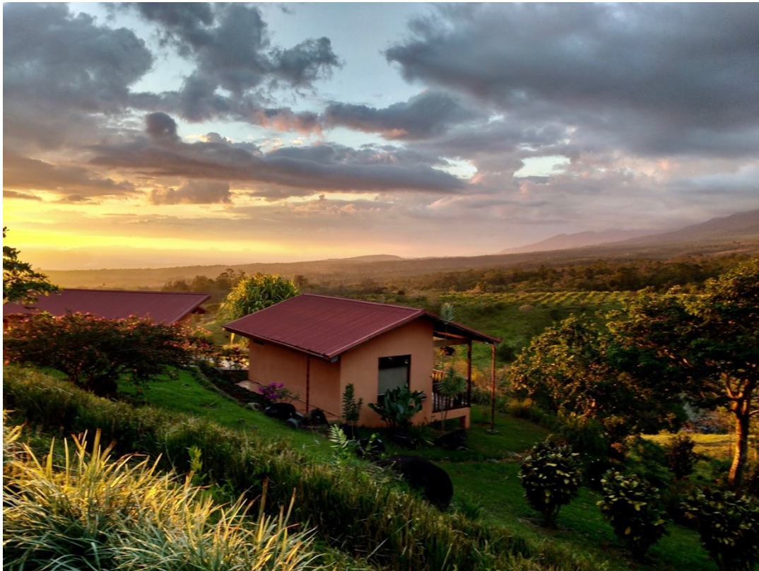
FIGURE 7: Finca LILO cabins at sunset