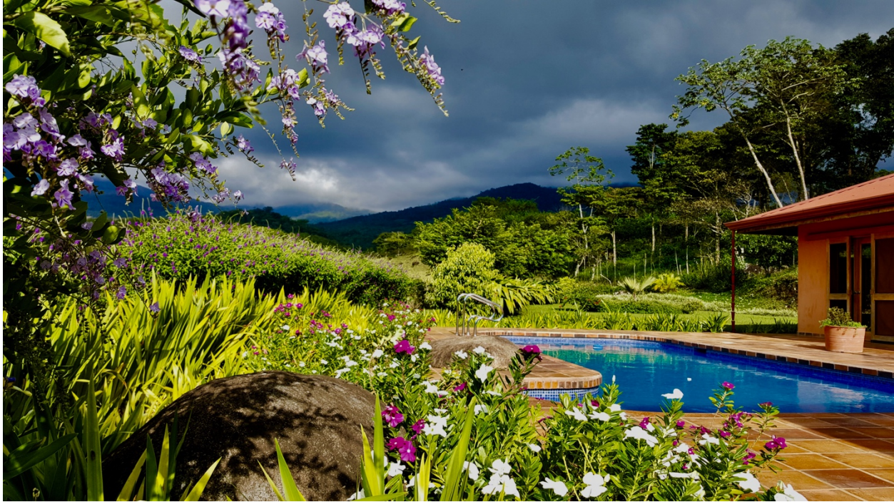
Figure 14. View of house, pool, gardens on Finca LILO

Toward the end of Phase 1 sufficient experience will be in hand to enable the start of planning and fundraising for Talamanca Land Bank Phase 2 for endangered watersheds elsewhere in the Biolley District.