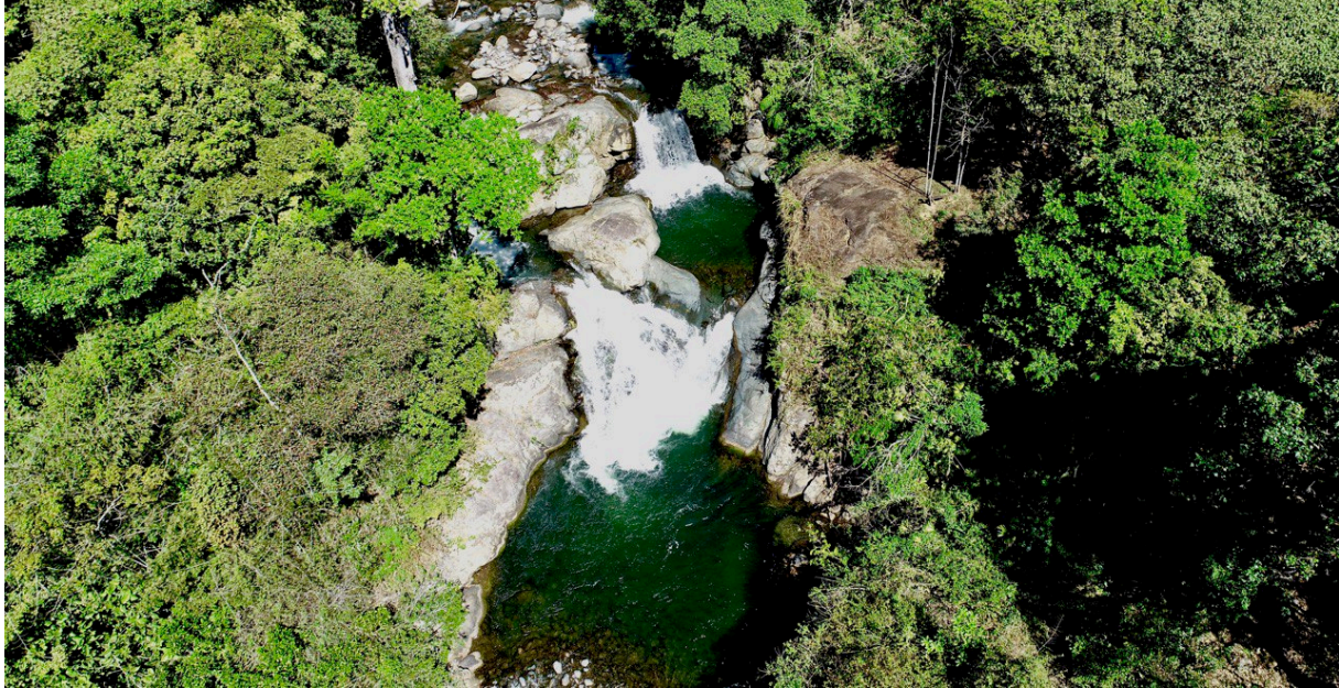
FIGURE 2. An aerial view of the Rio Platanillal at a location bounded on either side by target Land Bank properties. The river boasts multiple waterfalls plunging into deep, refreshingly cool pools suitable for swimming (see Figure 3). Bordered by large rocks ideal for sunbathing, and surrounded by lush tropical vegetation where wildlife like basilisk lizards that walk on water, monkeys, innumerable bird, insect, and exotic plant species may be experienced.