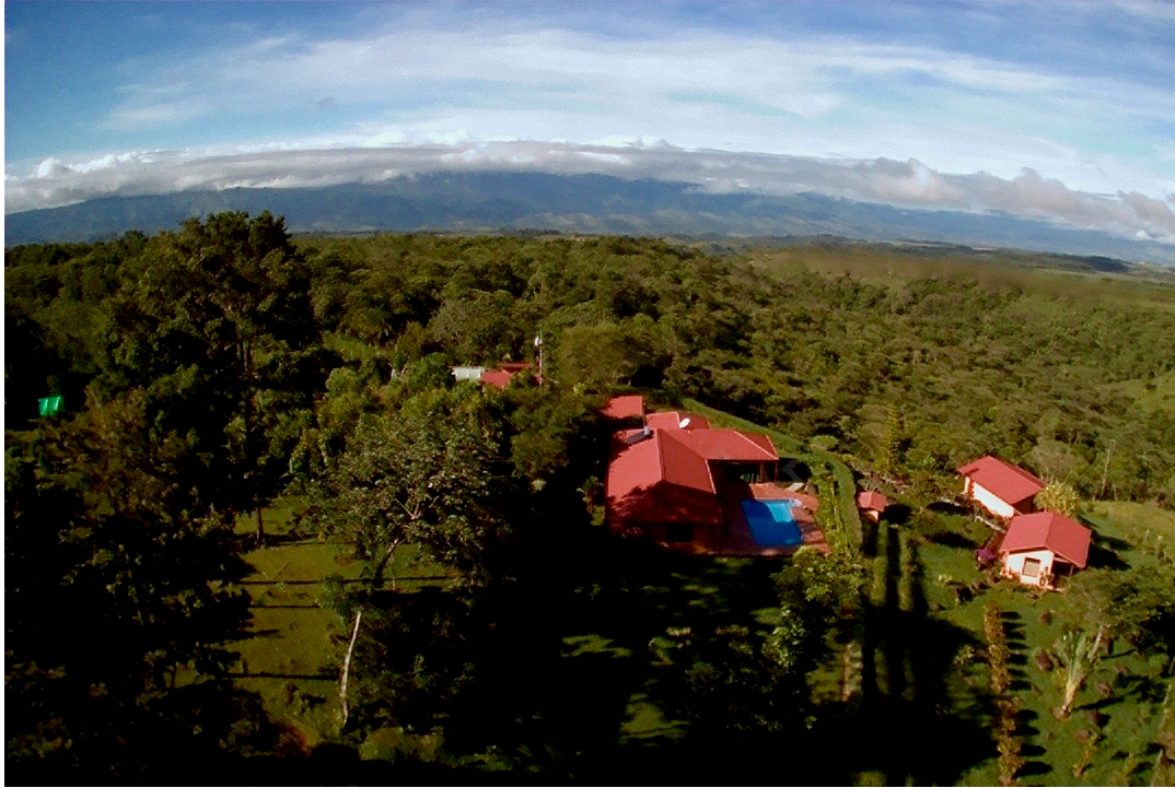
FIGURE 6: Finca LILO house, pool, cabins, with Pacific coastal range in background