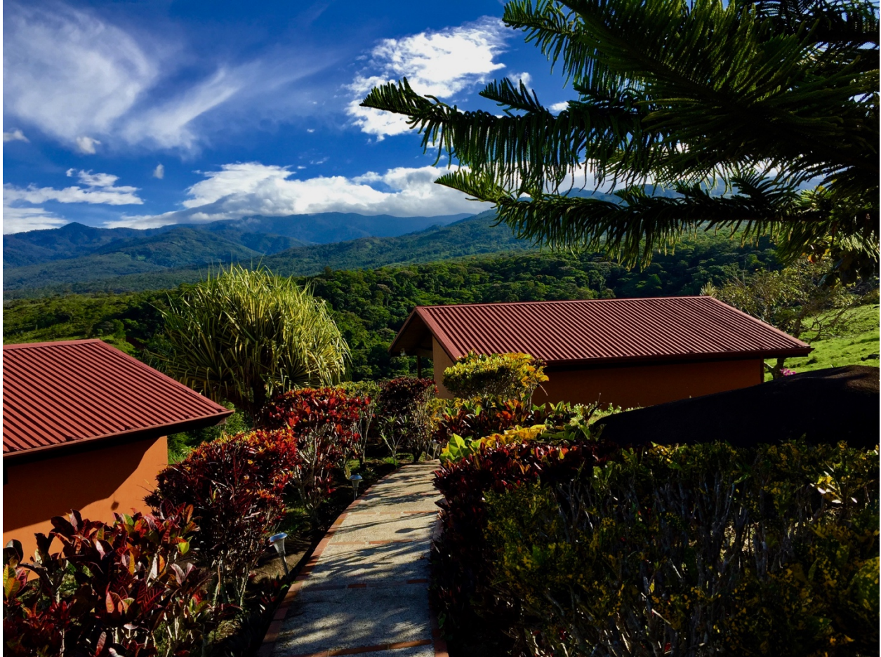
Figure 11. Path leading down to the two Finca LILO cabins that will soon be available to rent

The final aspect of Phase 1 is to secure funding and start development of more extensive eco-tourism/education facilities on the acquired Land Bank properties. This development would entail construction of buildings that could host up to 30 people. The plan is to build a central meeting facility with food service. Housing will be in separate cabins that host 1-4 people each, each being located in a natural rainforest setting. In addition to these basic facilities, eco-tourism amenities such as forest trails, canopy tour structures, paths, and so forth will be needed. On a more basic level, roads, utility service, and landscaping are also necessities. The site of the learning center within the Land Bank will be determined at a later date, but options are immediately available at Finca LILO. Some preliminary estimates for the central facility plus four cabins places the development cost at about $600K. The expectation is that a fully-built facility for up to 30 people could be realized for the target fundraiser of $1.0M. This development would start when sufficient funds have been raised, and will probably require about 1.5 years to complete.