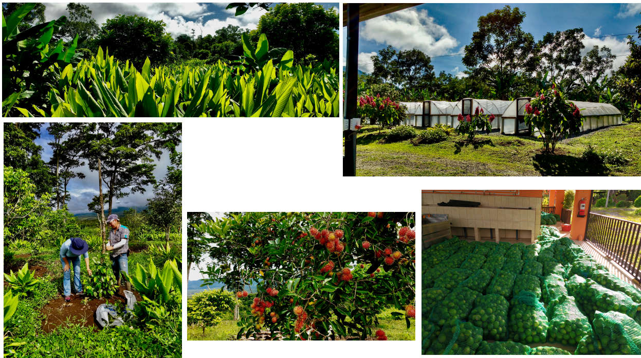
FIGURE 4: Collage of BiolleyFarms agricultural production images. Clockwise from upper left: turmeric in food forest, solar drying beds, Persian limes ready for market, rambutan fruit on tree, black pepper plant

Finca LILO will be the anchor property of the Land Bank. BiolleyFarms, SRL is already a functioning business and has experience in processing and exporting its products. Therefore, all the elements of the operation of the farm are already in place on a small scale. The cooperation of the Talamanca Land Bank and CULTIVO can help the mutual vision of these organizations grow with BiolleyFarms as the agent on location.