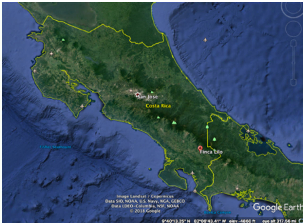
Figure 8. General location within Costa Rica of Phase 1 of the Land Trust.

The even closer view, Figure 1, outlines (in several colors) the approximate location of the proposed Land Bank acquisitions for the initial phase of the project. The anchor property for this plan is Finca LILO, a 57-acre (23-hectare) property that already boasts significant infrastructure and is the home of BiolleyFarms, SRL. The five other selected properties are undeveloped, the four largest of which border the Rio Platanillal. These properties are the same ones featured in the Land Bank introductory video (YouTube link to video found in Section XIII).