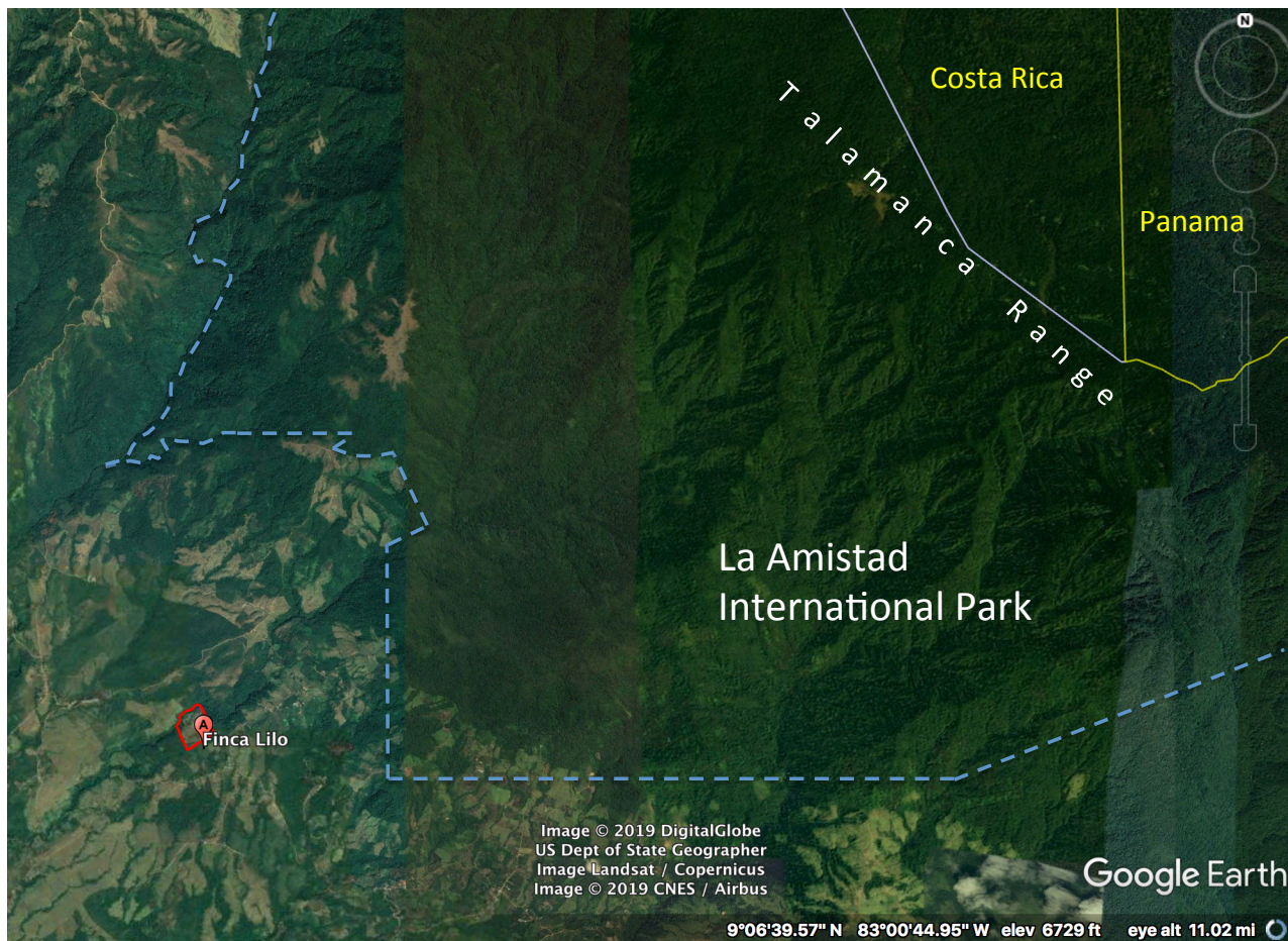
Figure 9. The region around Finca Lilo, vicinity of initial Land Bank acquisitions, is shown in this satellite imaging from Google Earth. The image illustrates the relationship to and the vicinity of La Amistad International Park, the boundary of which is outlined by the dashed blue line.

Table 1 lists the target properties for Land Bank acquisition, indicating their sizes and anticipated purchase prices. The listed cost of Finca LILO is based upon a 2019 formal comprehensive appraisal, plus additional non-appraised assets such as permanent farm infrastructure, interior furnishings, and prior investments in productive agriculture (i.e. fruit trees, etc.), leading to a total value of $1.5M. The other properties have no infrastructure. The costs of these properties result from preliminary inquiries with their respective owners, all of whom are interested in selling.