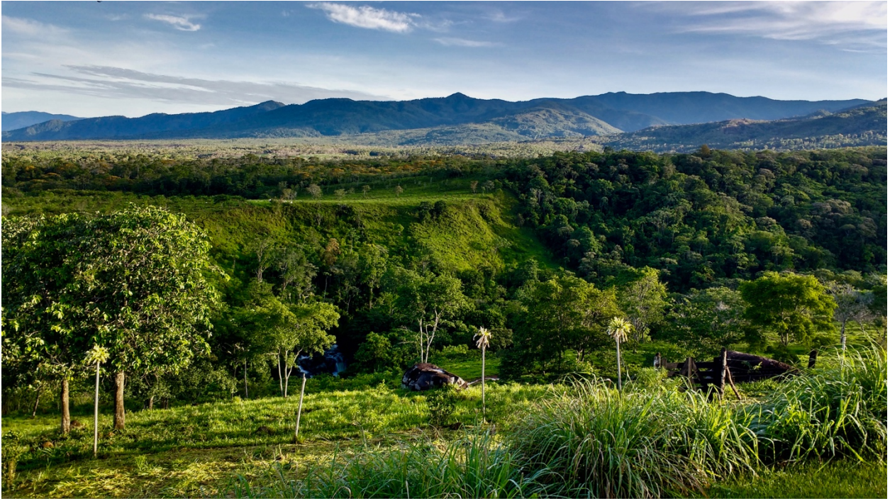
Northward view of the Talamanca Mountain Range and La Amistad International Park from the site of the Talamanca Land Bank