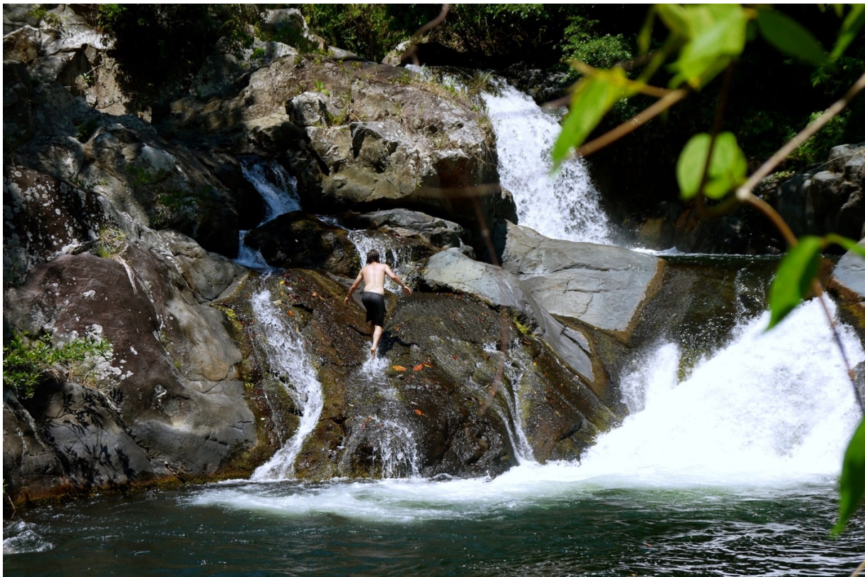
FIGURE 3. Enjoying the Rio Platanillal flowing between two of the target properties of the Talamanca Land Bank